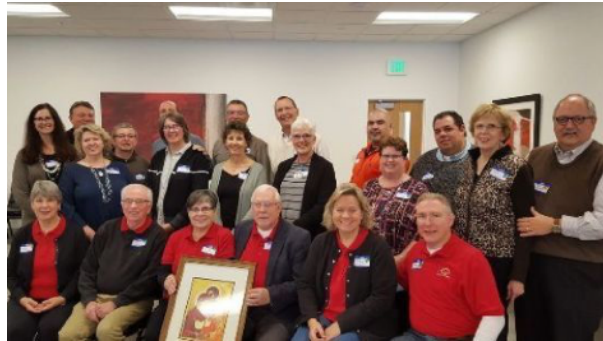
College Meeting Toledo, Ohio