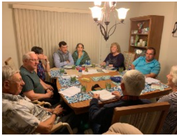
We were guests at Jacksonville, Fl. Sector Team Meeting