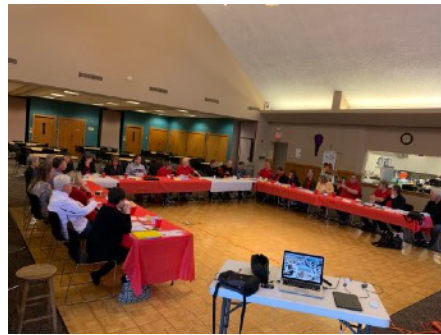
College Meeting, Des Moines, Iowa (Central & North Central Regions)