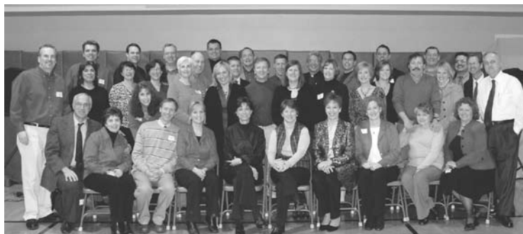
Teams in Massachusetts gather for a group photo as part of their World Marriage Day festivities.

It is difficult to describe what happened next because it was much better to live it. The decoration was simple yet lovely with a Valentine's theme. One high-