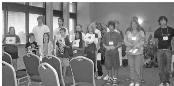
Team teens receive their certificates of appreciation from the organization Feed My Starving Children. During the conference, the teens packed over 7,000 meals to be shipped to the world's poorest countries.