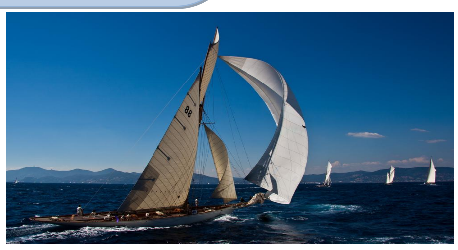
And now, put out into deep water.... (Luke 5. 4)

It is part of the mission of the information couple to encounter the enquiring couple on a more personal level, in order to help them find an answer better suited to their search. This follow-up is important, it is part of our duty to evangelise. We should not leave "these sheep" alone in darkness.