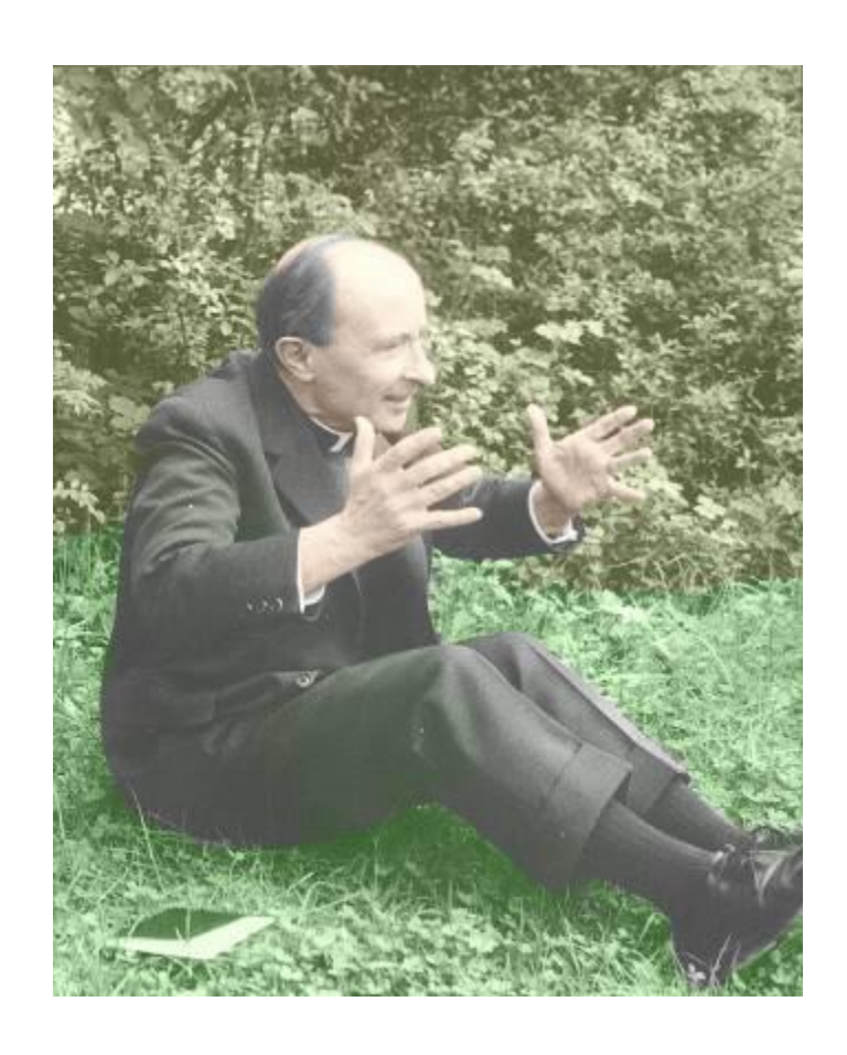
Father CAFFAREL, prophet of marriage (Extracts from texts)