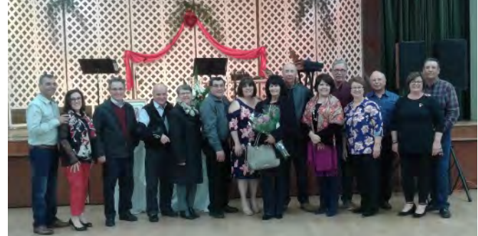
Turlock Portuguese Sector Retreat 2019