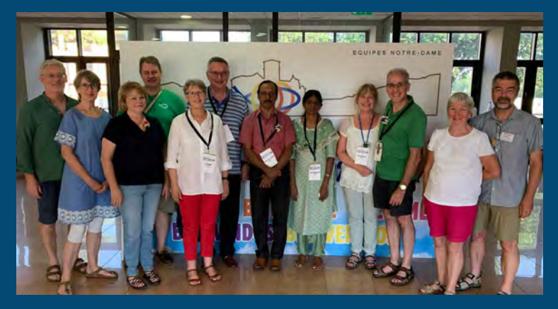
This is all the English speaking countries that attended the International Gathering.