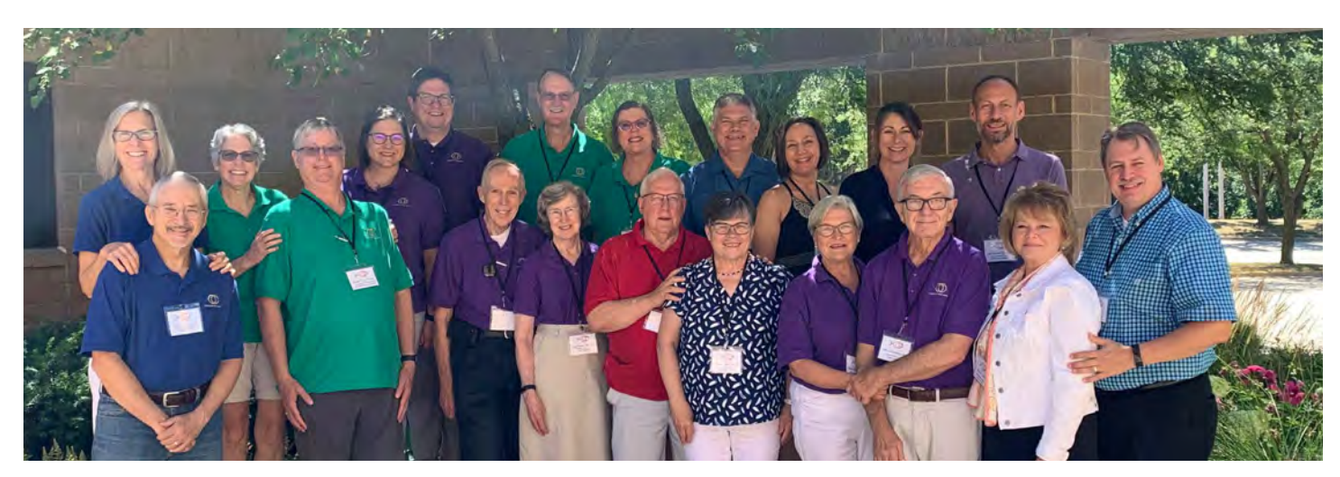
Super Regional Team together again for the first time since 2019. We are so grateful for the time together.