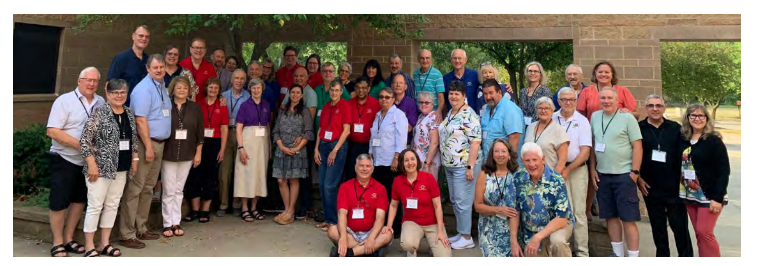
Super Regional College meeting August 4-6. We met at St Francis of Assisi parish in Des Moines Iowa.