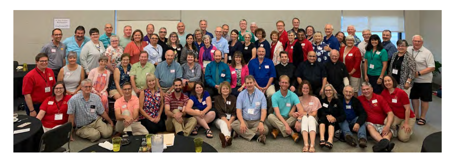
Our Super Regional College meeting ended with Mass followed by a potluck sponsored by the Des Moines, Iowa sector. Here is the group! Super Regional College and Des Moines Sector.

Thank you Des Moines Sector for your amazing hospitality!