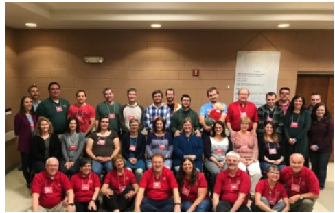
New Teams Weekend Celebration at Fargo, ND