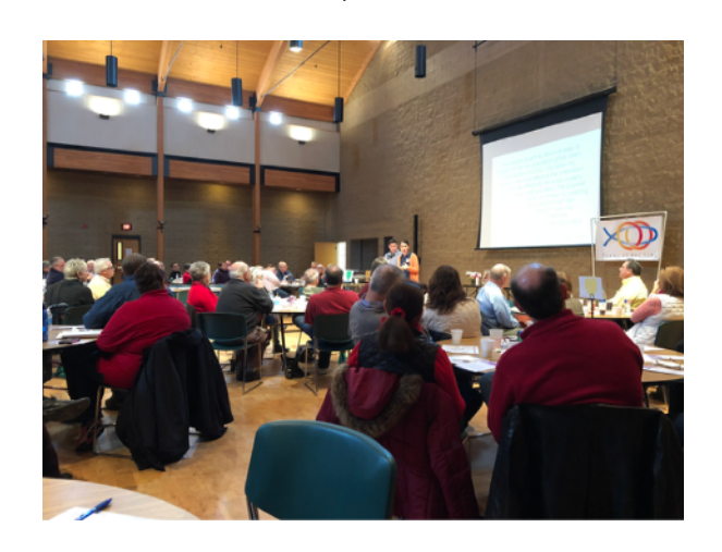
Winona MN, Service Team

Des Moines, IA Day of Reflection speakers