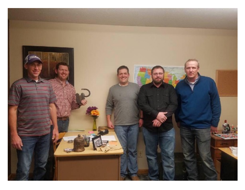
Husband Team Kansas B