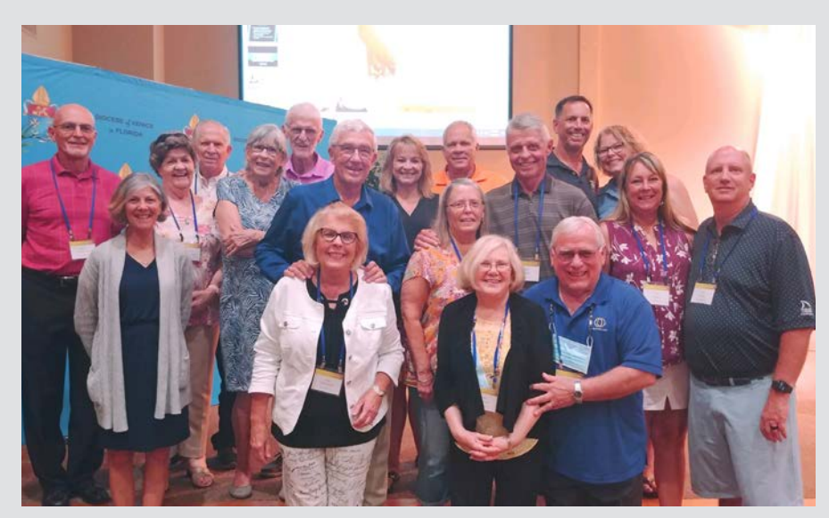
Participants at the "Together in Holiness" Retreat in Naples, Florida.