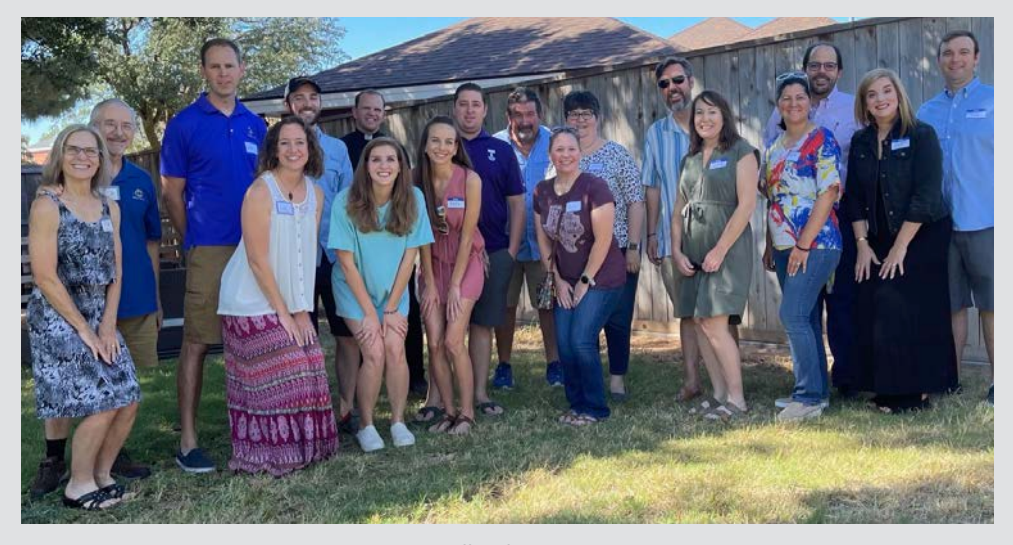
Midland TX Team 1