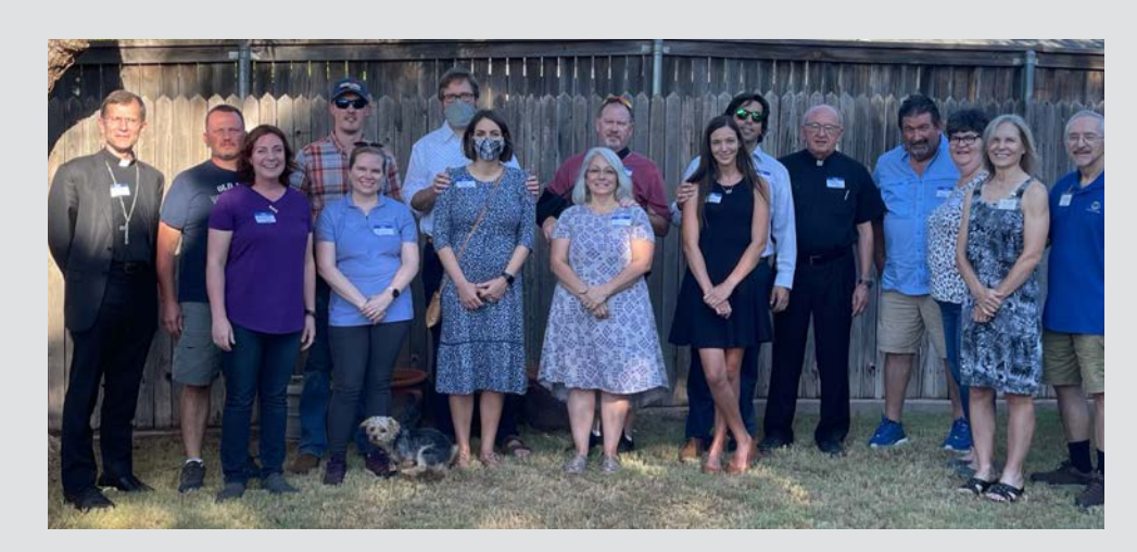
Midland TX Team 2